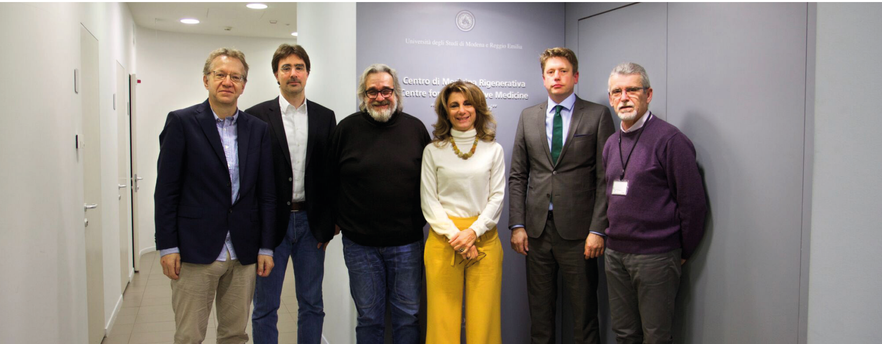
The research team behind the scientific breakthrough